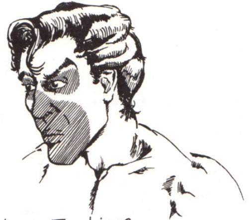
Superhero Tan Lines